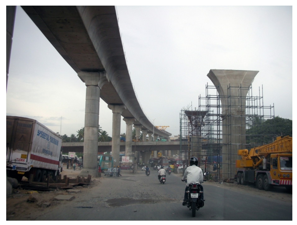
Road and metro construction in Bangalore.

Motorized transportation in India presently only contributes 10 percent of the country's total CO<sub>2</sub> emissions, compared to 30 percent in the United States, where CO<sub>2</sub> emissions from motorized transportation are, in any case, ten times higher than in India.<sup>47</sup> Therefore, in terms of climate change, there are other contributing factors that deserve more attention in India. And there are other countries that have to do much more when it comes to climate change mitigation. The most serious concerns related to motorized transportation in Indian cities have to do with its negative impact on the citizens' health, on the local environment and on the potentials for development.