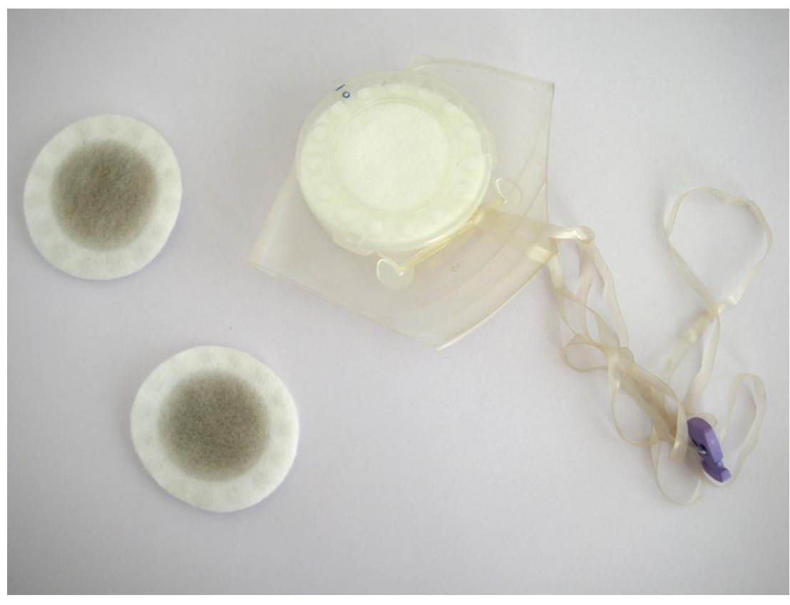
The results of 90 minutes of cycling in Bangalore.