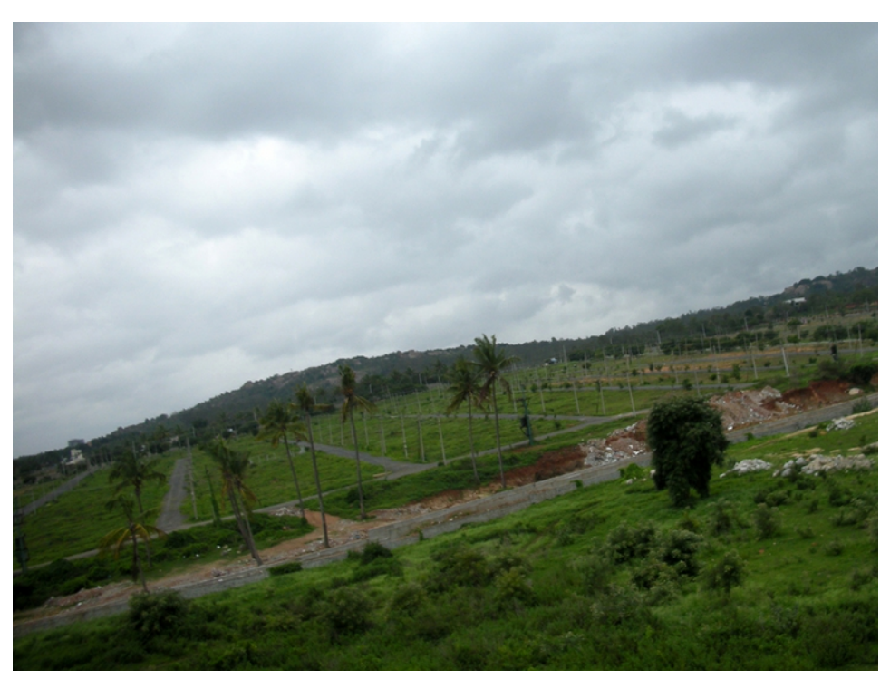
Development in anticipation of an expressway.

In addition, farmers, activists and others have been fighting the project with demonstrations and legal proceedings. In one of these cases, over one hundred prominent people, including a former prime minister of India and three former chief ministers of the State of Karnataka, local politicians, high-ranking bureaucrats and businessmen, are facing charges for "land grabbing" of an area around the expressway of almost the same size as the entire city of Bangalore – a city of more than 8 million people!