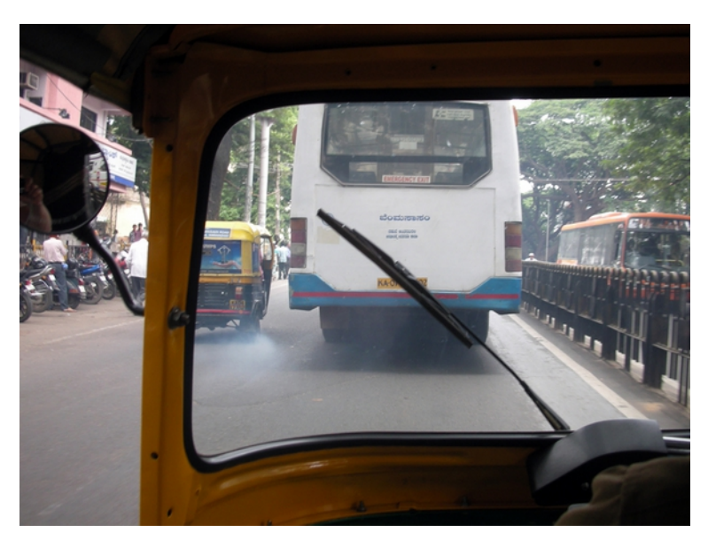
A polluting auto-rickshaw. Photo © Henrik Valeur, 2012.

Auto-rickshaws are, however, not the only source of pollution in the city. Blue and black fumes are also being emitted from buses, trucks and even from new diesel-fueled cars.<sup>5</sup>