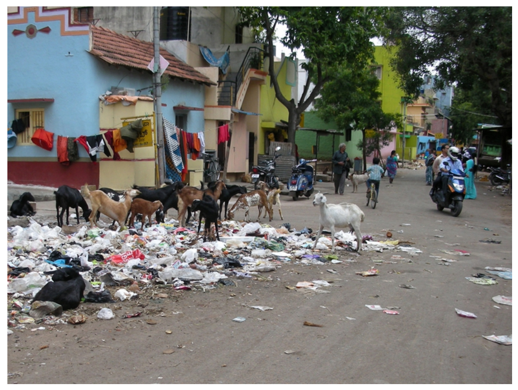
Goats searching for food in garbage dumped on the street.

Bangalore is one of the fastest growing cities in India and huge wealth is being generated there but few citizens benefit from it. In fact, during the past decade, most citizens have witnessed a dramatic deterioration in the quality of life, as spaces for social activities have vanished, roads have become severely congested, pollution has reached alarming levels, crime – or the fear of crime – is widespread and garbage litters the streets.