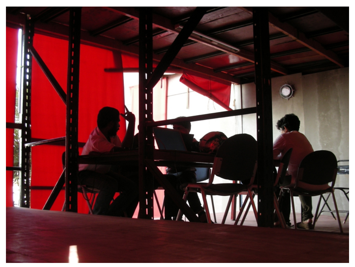
A Jagga studio.

Two years after it had been constructed, it was dismantled, moved and reassembled at a new location, a few kilometers away.