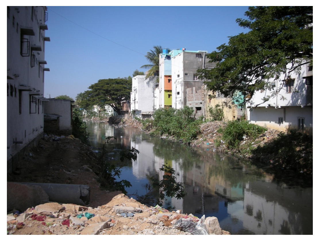
The city turns its back on a nallah.

Cleaning up the nullahs – and maintaining them clean – could perhaps also provide livelihood opportunities for the poor people who live around them. The nullahs themselves could then be used as wildlife corridors and to improve biodiversity and prevent flooding. Surrounding areas could be used for recreational and entrepreneurial activities, where people from different parts of the city – and from different parts of society – could meet.