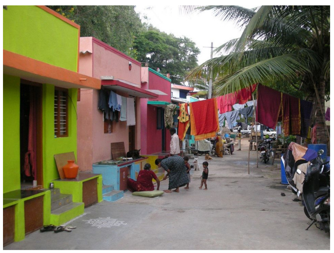
Low income housing.

I don't want to romanticize the slums but could it be that there are some lessons that the rest of us can learn from there?