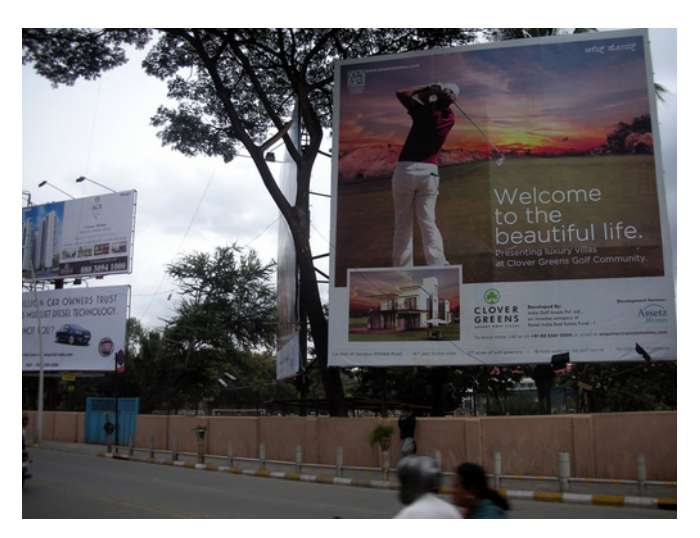
Welcome to the beautiful life!?

I recently spent half a year in Bangalore and came away with a somewhat different understanding.