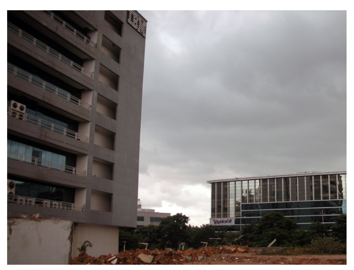
IT companies.

In fact, as a result of poor urban planning and management, the very same IT companies that are supposed to have made the city a success are now beginning to move away, many of them towards the new airport, some 30 kilometers north of the city centre, and some of them even to other cities.<sup>3</sup>