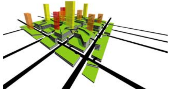
Figure 3 Beijing project

This project has set itself the task to transform a heavily polluted site, located between the 4 th and 5 th ring road in Beijing, into a green living environment for various social segments of the fast growing population in Beijing. The project is concerned with the treatment of contaminated soil (4.000.000 m 3 ) left behind by the huge industrial complex which occupied the land before, the implementation of Transit Oriented Development, water recycling and mixed housing for the new postindustrial city.